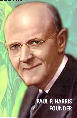
PAUL P. HARRIS FOUNDER